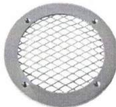
Cast Trim Ring With Grill Brass with gold grill PN. N-73015 Chrome with silver grill PN. N-73016