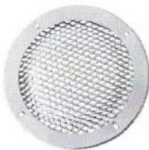
Light Weight Internal Grill Brass with gold grill PN. N-73010 Chrome with silver grill PN. N-73011

These internal grills can be fitted to the inside to finish the installation of permanent Ventair and Ventilite installations and are available in brass or chromed brass finish.