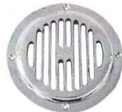
Cast Grill Cast Brass PN. N-73020R Cast Chromed Brass PN. N-73021R