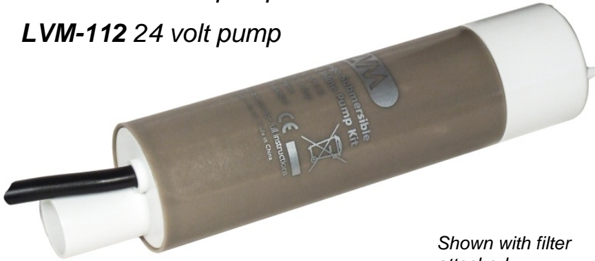
Shown with filter attached